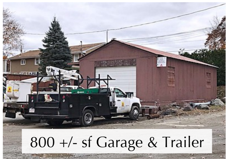
800 +/- sf Garage & Trailer