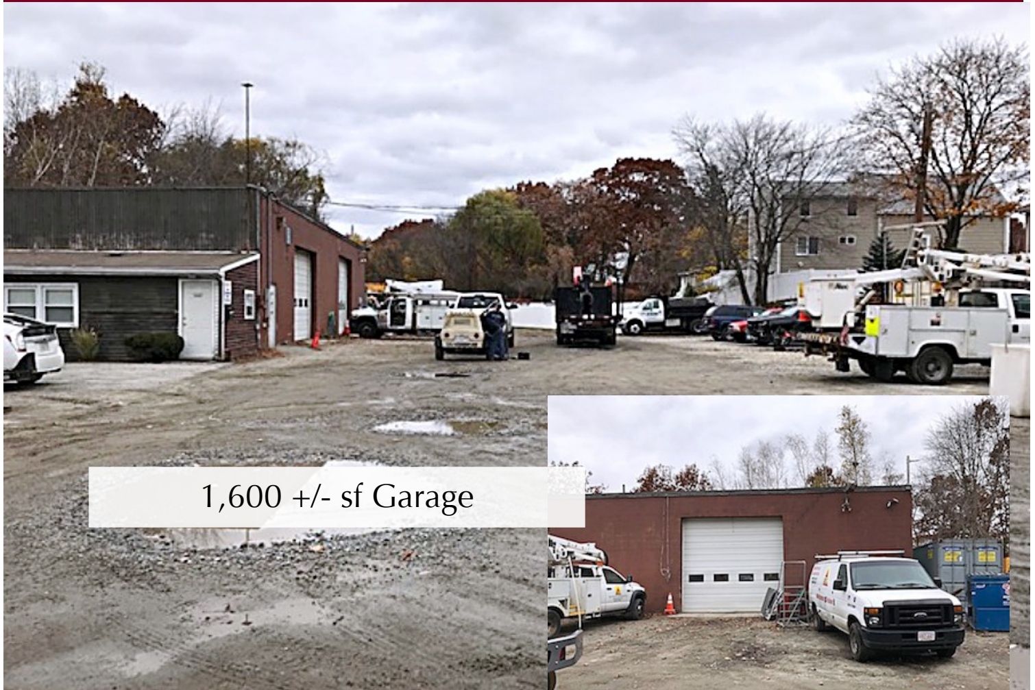
1,600 +/- sf Garage