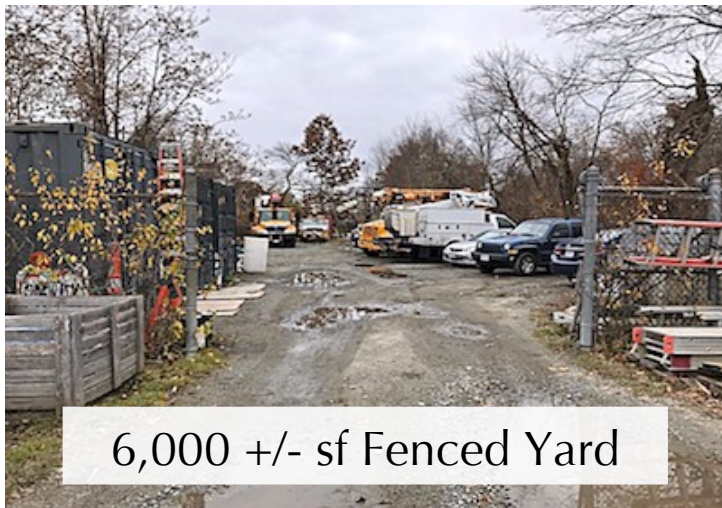
6,000 +/- sf Fenced Yard