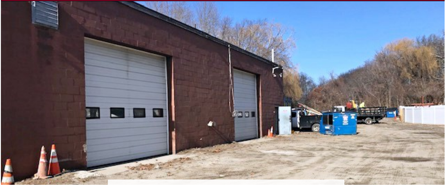
1,600 +/- sf Garage with Outside Parking