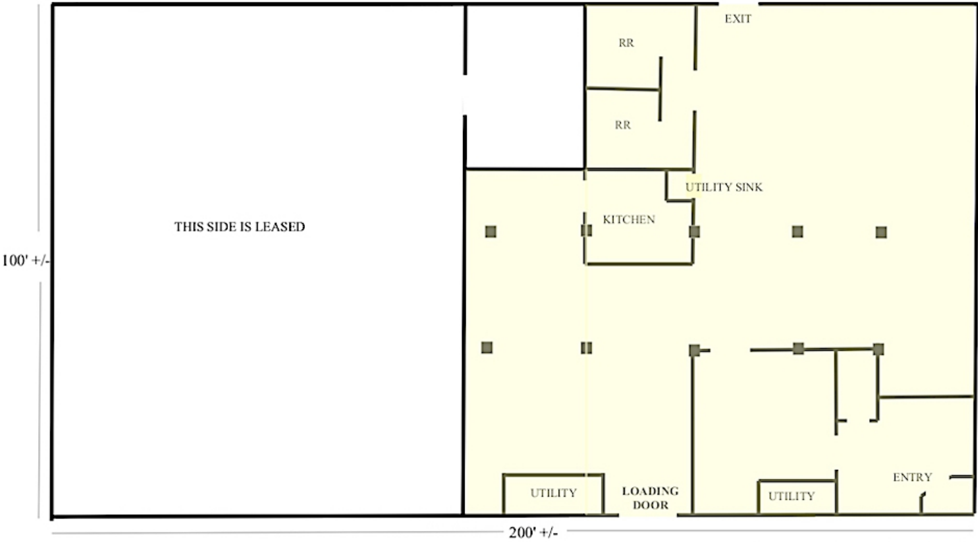
Plan not drawn to scale. Plan not exact.